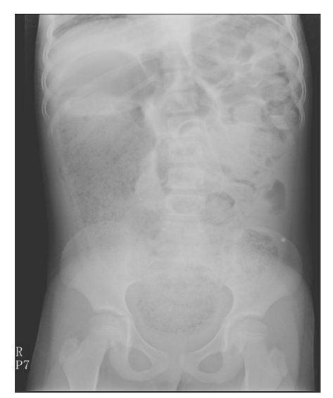
Figure 1. Abdominal plain radiograph (BOF)

Routine laboratory evaluation, including a complete blood count, liver and renal function test, urinalysis, and blood chemistry studies, were within