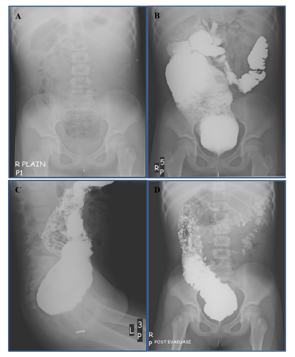
Figure 2. A contrast enema study with water-soluble contrast: A. Plain AP, B. Contrast AP, C. Contrast Lateral, D. Post Evacuation.

with fecal material retention (Figure 1).